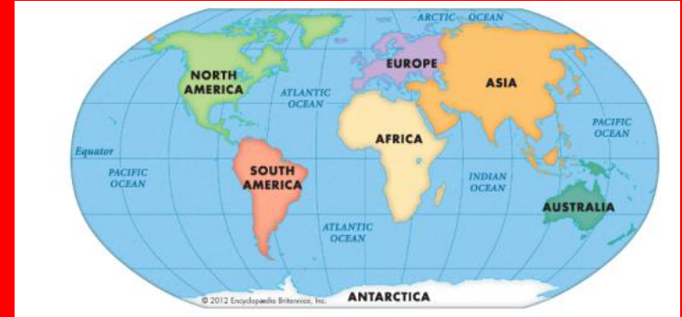
The continents and oceans