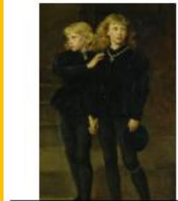
The Princes in the Tower