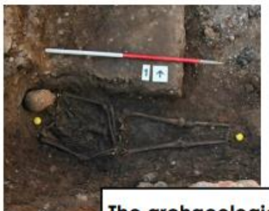
The archaeological dig, Leicester

Richard III died at the Battle of Bosworth becoming not only the last Plantagenet king but also the last king to die in battle. Richard's burial site was discovered by archaeologists in 2012 under a car park in Leicester.